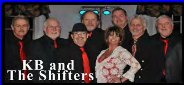
KB and The Shifters