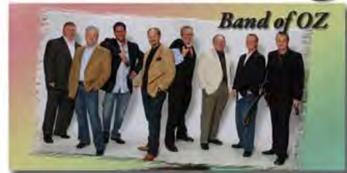
Band of OZ