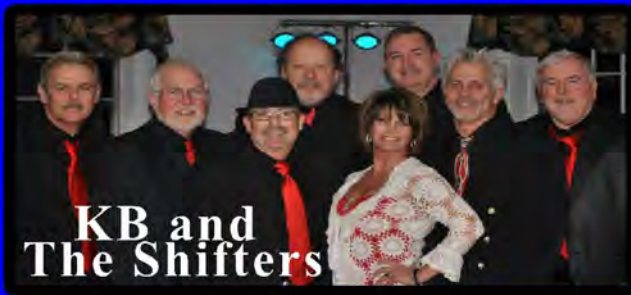
KB and The Shifters