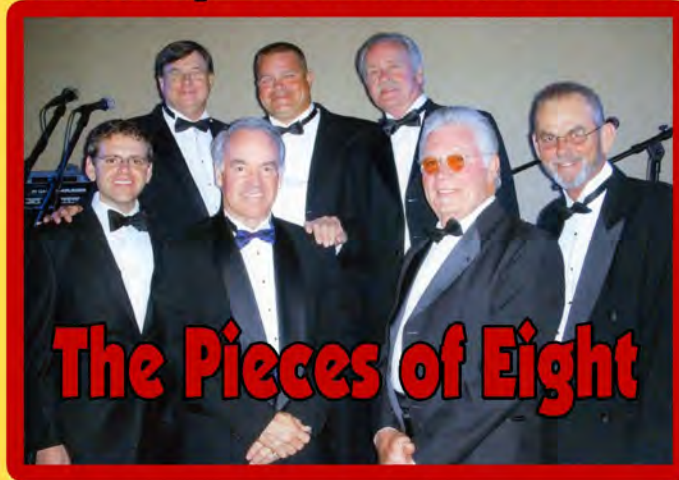
The Pieces of Eight