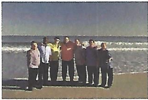
Holiday Band 2015 Carolina Beach Music Hall of Fame Inductee