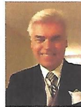
Pat Gwinn Syndicated Radio Personality